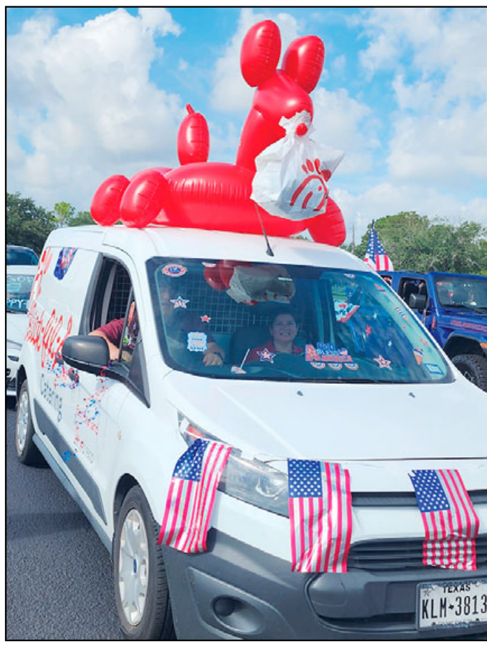
Chick-fil-A Pearland joins in the parade festivities