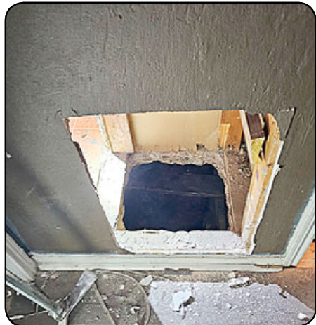
Tunnel under home

At press time, additional charges of utility theft were pending.