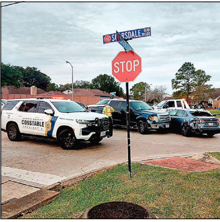
A major two-vehicle accident in the 10500 block of Scarsdale Boulevard near Beamer Road recently forced the complete closure of the local thoroughfare in both the eastbound and westbound directions, according to Harris County Precinct 2 officials.