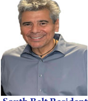
South Belt Resident