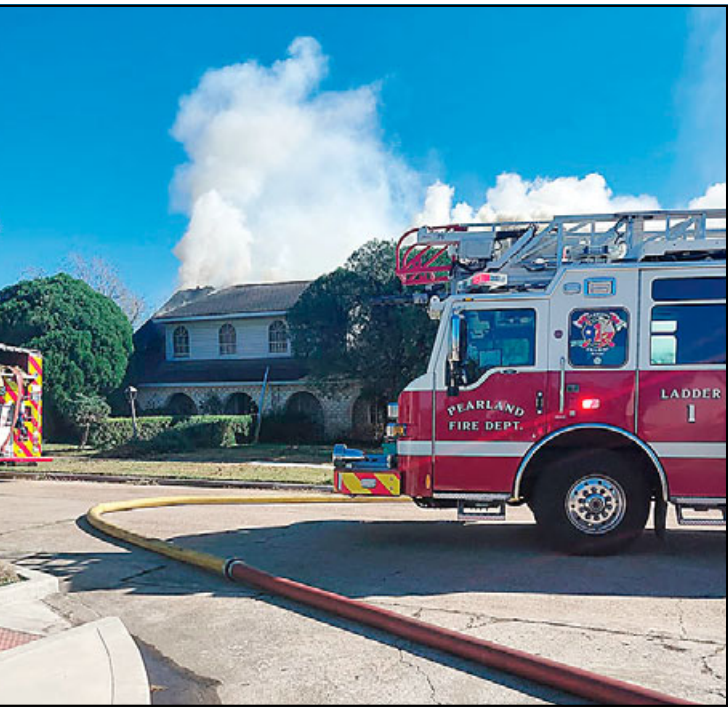
A Sagemeadow house caught fire Tuesday, Dec. 30, in the 10000 block of Sageplum Drive near Blackhawk. The Southeast Volunteer Fire Department is shown above responding to the incident, with assistance from the Precinct 2 constable’s office. No injuries were reported. The cause of the blaze was unknown at press time.