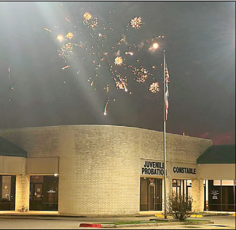
The community celebrated New Year’s Eve this past week, saying goodbye to 2025. While there was no official fireworks show in the area, there was no shortage of amateur pyrotechnics experts to fill the void. Above, fireworks are shown above the Harris County Annex on Scarsdale.