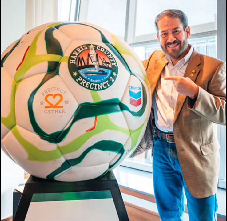
Harris County Precinct 2 Commissioner Adrian Garcia recently joined La Camara de Empresarios Latinos de Houston for a panel to discuss the projected economic impact of the upcoming World Cup and potential opportunities for small businesses. Set to take place June 14 to July 4 at NRG Stadium, the 2026 FIFA World Cup is expected to bring in millions of tourism dollars for small businesses.