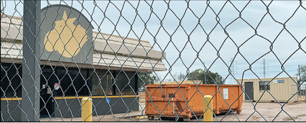
A chain-link fence was recently erected around the former Church's Chicken in the 11300 block of Hughes Road at Sageglen, as construction crews are preparing to refurbish the abandoned structure. The former fast food

restaurant has drawn the ire of several residents who complain of waste and graffiti at the neglected property. At press time, it was unclear what future plans were in place for the property.